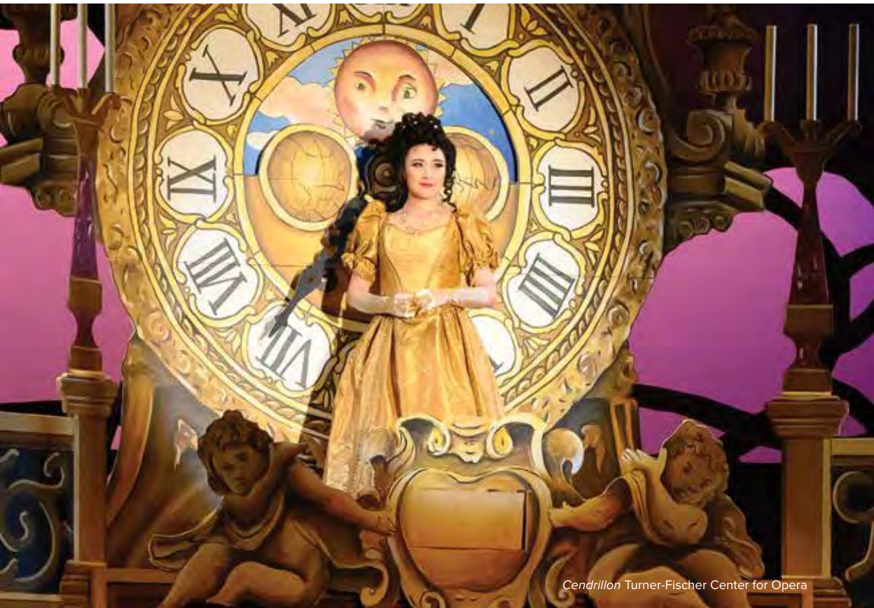
Cendrillon Turner-Fischer Center for Opera

The Turner-Fischer Center for Opera at LSU offers a comprehensive training program for aspiring opera students, who work with a dynamic and accomplished faculty. The Center produces multiple full-scale productions each year, collaborating with the LSU Orchestral Studies area and LSU School of Theatre. Opera alumni can be seen performing on the world's greatest opera stages, including the Metropolitan Opera, La Scala, Covent Garden, Houston Grand Opera, San Francisco Opera, and more.