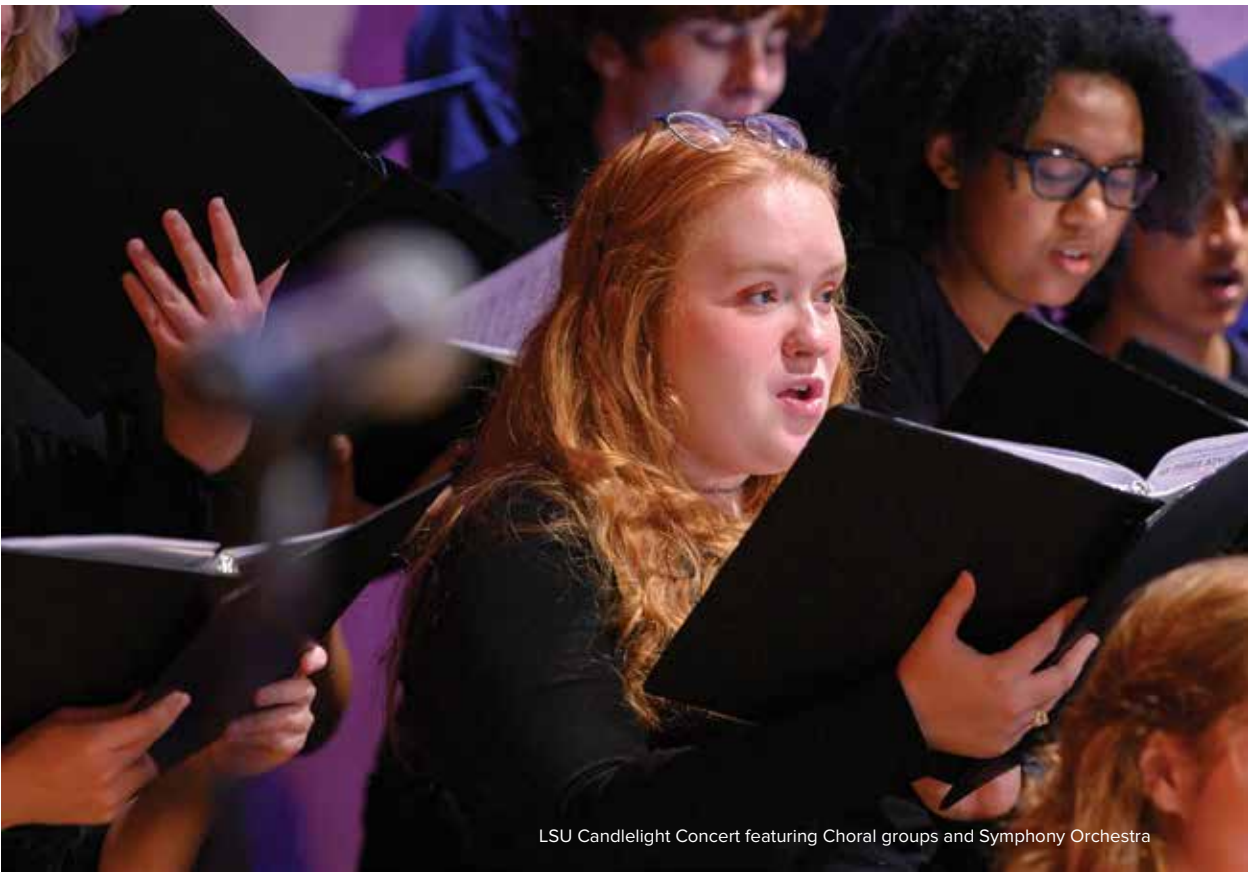
LSU Candlelight Concert featuring Choral groups and Symphony Orchestra

The LSU Choral Studies area offers a variety of choral ensembles for students, each with an individual character and mission. Chorus members represent a cross-section of the LSU student population, including undergraduate and graduate students, who perform literature ranging from dramatic cantatas to gospel spirituals and folksongs.