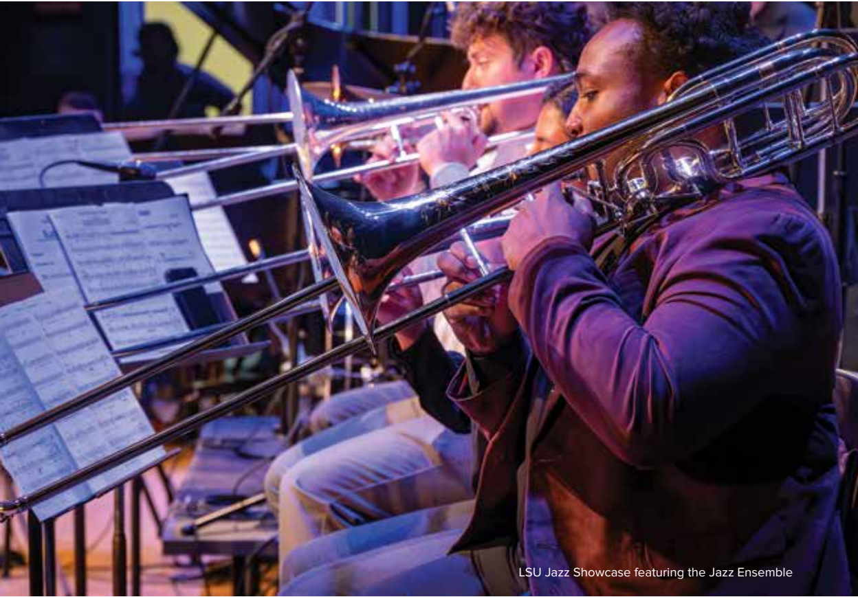
LSU Jazz Showcase featuring the Jazz Ensemble

LSU's Jazz Studies area boasts a rich history that can be traced back to the 1950s. Legendary jazz alumni, such as trombonist Carl Fontana and composer/pianist Les Hooper, have made significant contributions to America's great art form. The current generation of alumni includes saxophonist Brad Walker, active touring artist and top call player in New Orleans, and pianist Oscar Rossignoli, widely recognized as a rising star in New Orleans and beyond.